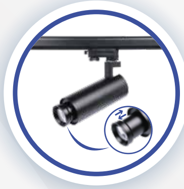
15° to 70° Zoom